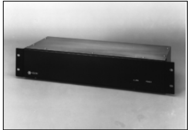
V1300X-IA ALARM INTERFACE

A single auxiliary relay output activates when any alarm input goes active. This relay may be used to control some external device, such as a VCR. In the case of multiple cascaded X-IAs, only the auxiliary output on the X-IA that received the alarm goes active. The AUX outputs on the other X-IAs do not go active.